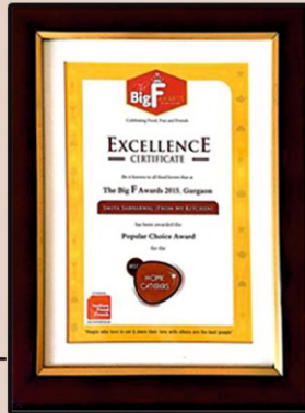
Big F Popular Choice Award