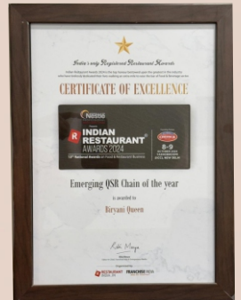
Emerging QSR Brand of the year 2024